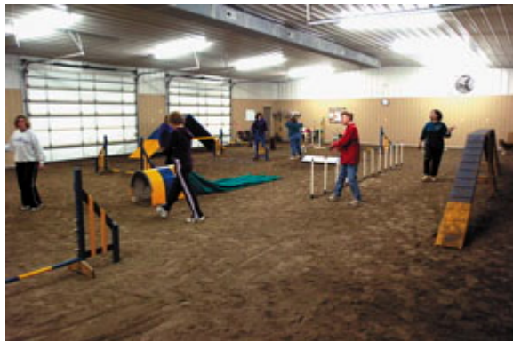
Getting ready: Dog owners walk the course, familiarizing themselves with the turns.